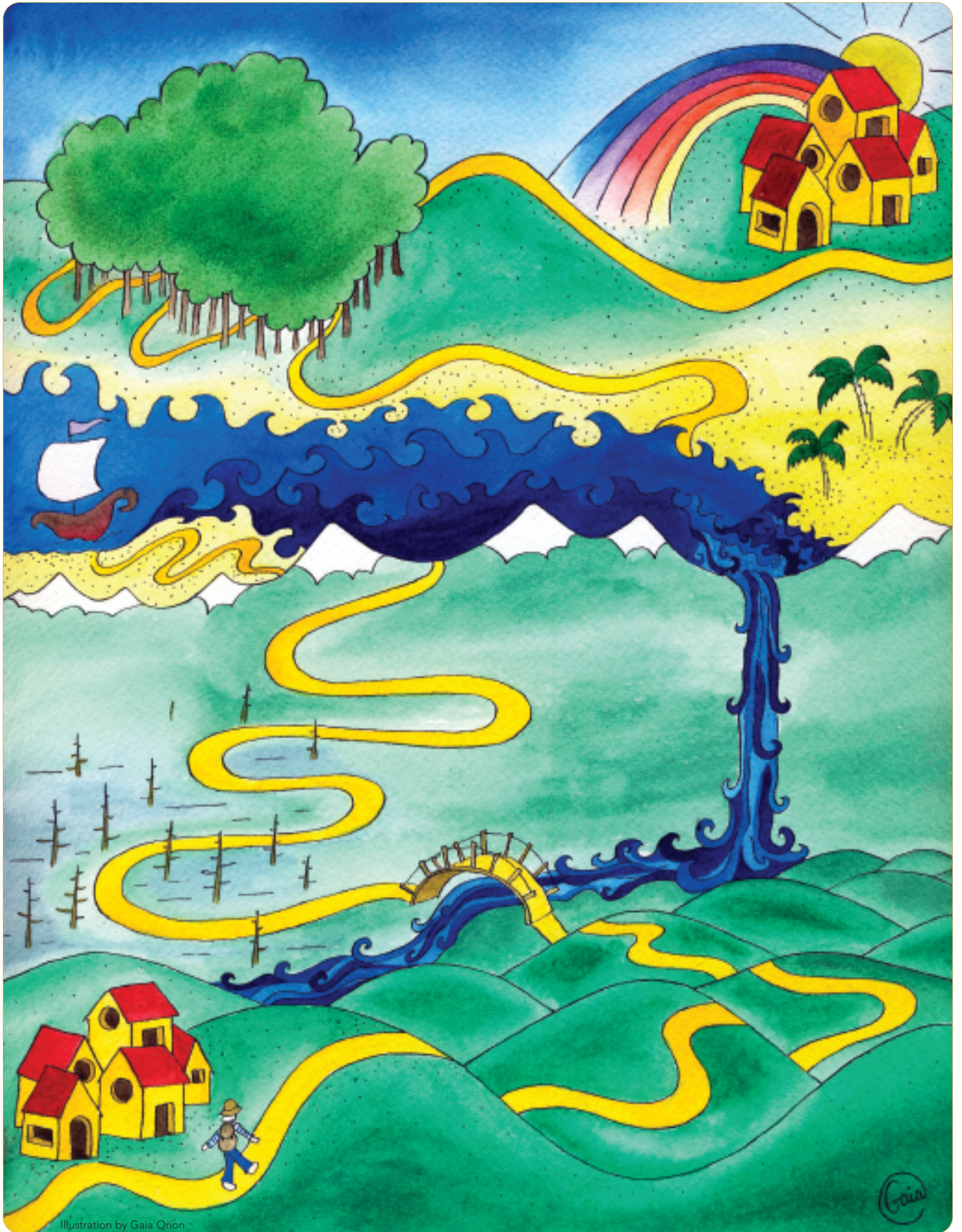
Illustration by Gaia Orion